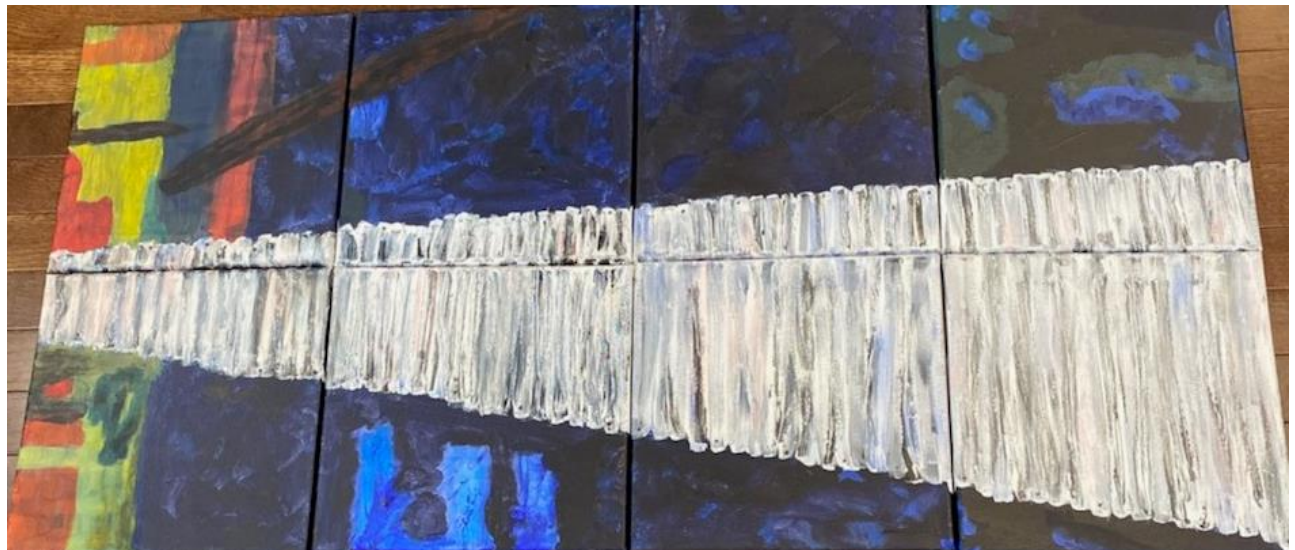
Peggye Tombro, "Walk on Water"